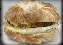
Sausage & Cheese Stuffed Biscuit