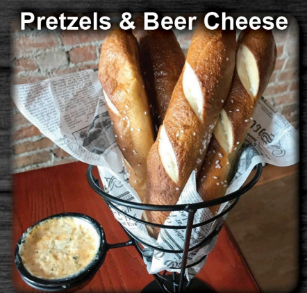
Pretzels & Beer Cheese