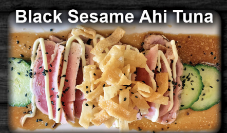
Black Sesame Ahi Tuna