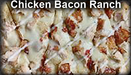
Chicken Bacon Ranch