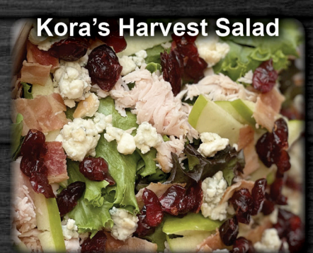
Kora's Harvest Salad

Crisp fresh romaine lettuce, cucumbers, tomato, shredded cheddar cheese and croutons. Choice of dressing: Ranch, Catalina, Toasted Sesame, Caesar, Poppyseed, or Italian.